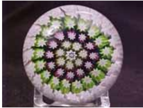
Perthshire Four Ring Concentric