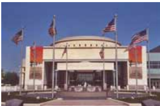
George Bush Presidential Library

This brief article in no way portrays the magnitude of the experience of visiting Texas A&M University, the MSC Forsyth Center Galleries and the George Bush Presidential Library. As with almost everything else in the state, it is BIG but the students and staff on campus are very friendly. If you are ever in the area, take the time to visit one of the best-kept secrets in Texas and explore Texas A&M University.