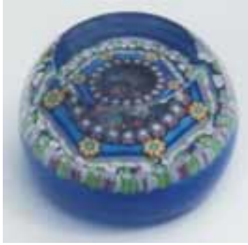
Perthshire 1976D Magnum Cushion Weight

canes, forming a tapestry of rose, green and white bordered by twist threaded latticino rods that add delightful texture to this fabulous piece. A moment afterward, I discover the “hidden garden” a step below and my breath catches as I view the entire artistry. A design believed to be unique to Perthshire, where the bottom level is visible only through an opening in the top layer, this was Perthshire’s first use of a two-layer set-up.